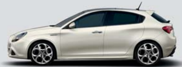
296 Ghiaccio White