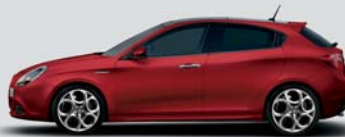
289 Alfa Red