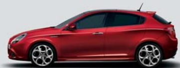
134 8C Red