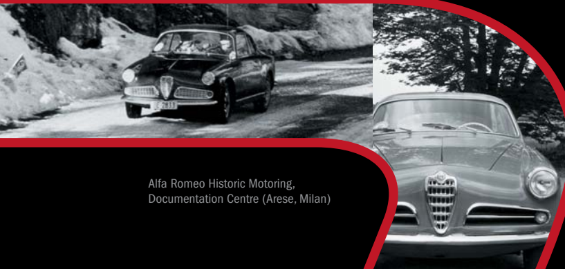
Alfa Romeo Historic Motoring, Documentation Centre (Arese, Milan)

But it wasn't just about looks; the car also had real substance. Reliable and accessible its price and running costs made it a dream to own. The Giulietta Sprint is the car Italians desire, a much loved automotive and social phenomenon with over 35,000 models produced.