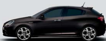
805 Etna Black