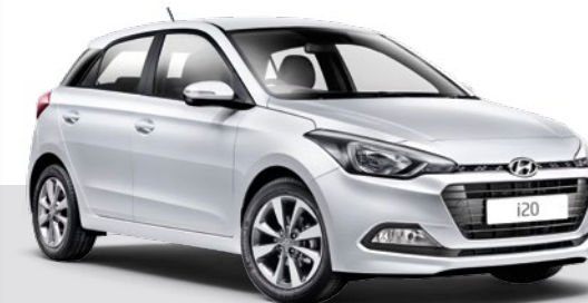
Polar White – Solid