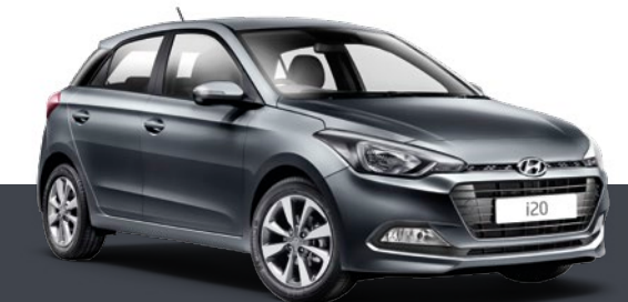
Stardust Grey – Metallic