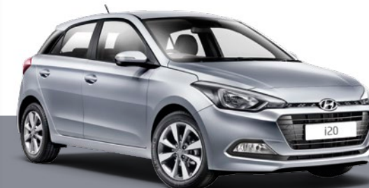
Sleek Silver – Metallic