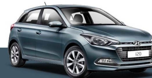
Aqua Sparkling – Metallic