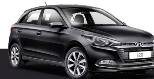
Phantom Black – Pearl