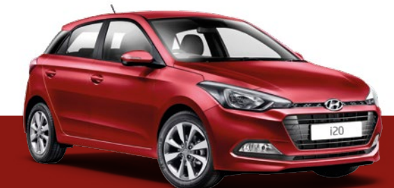
Red Passion – Pearl