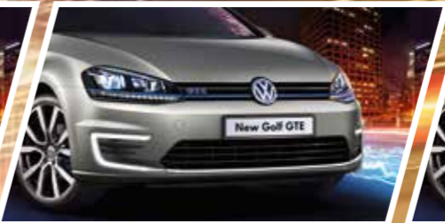
Tungsten Silver K5 Metallic*