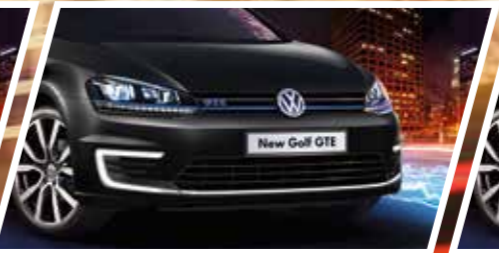
Deep Black 2T Pearl Effect*