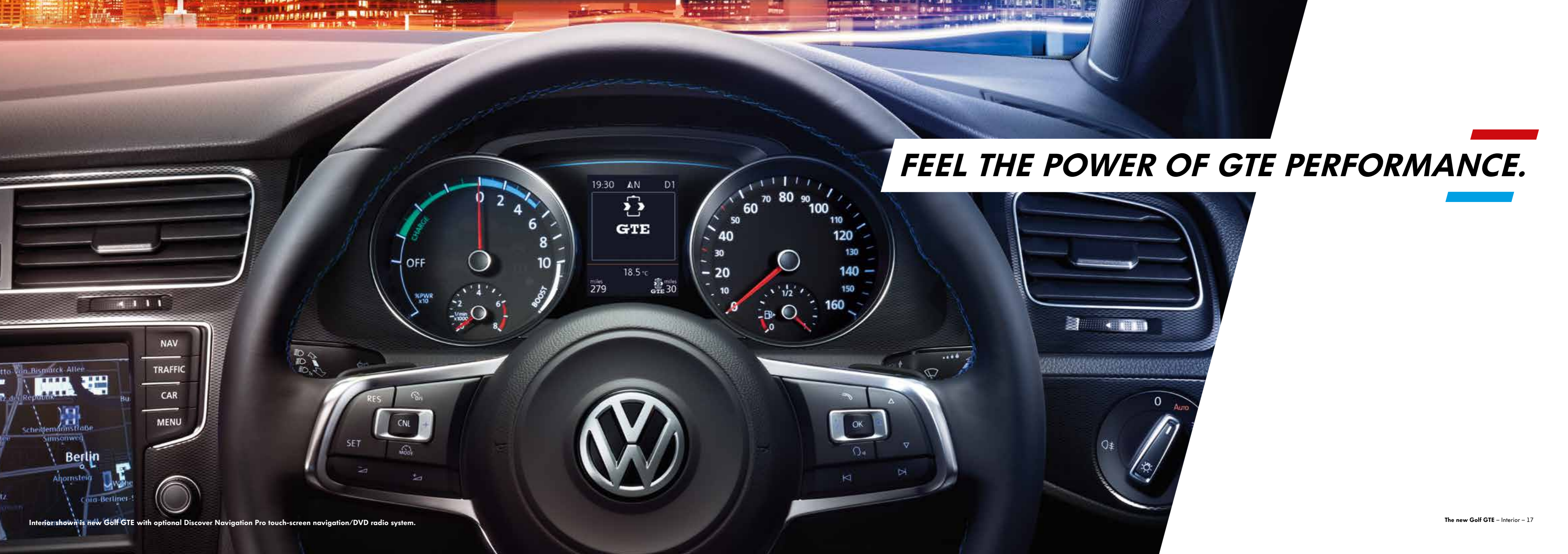
Interior shown is new Golf GTE with optional Discover Navigation Pro touch-screen navigation/DVD radio system.