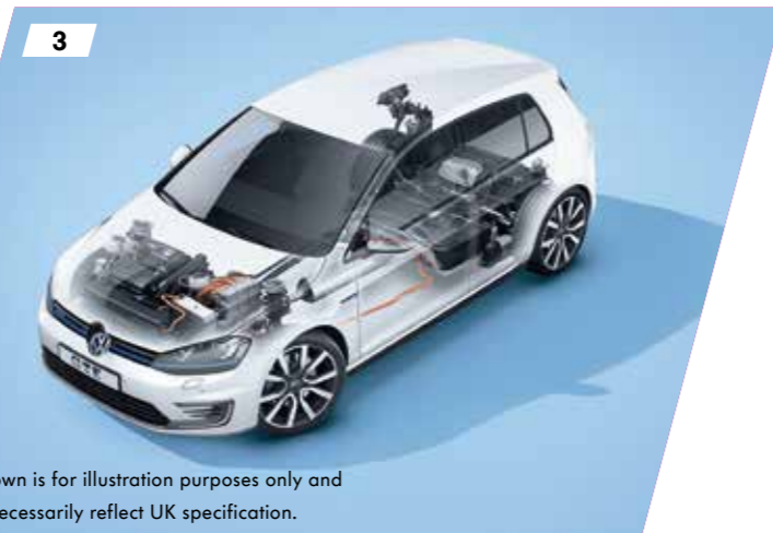
Image shown is for illustration purposes only and may not necessarily reflect UK specification.