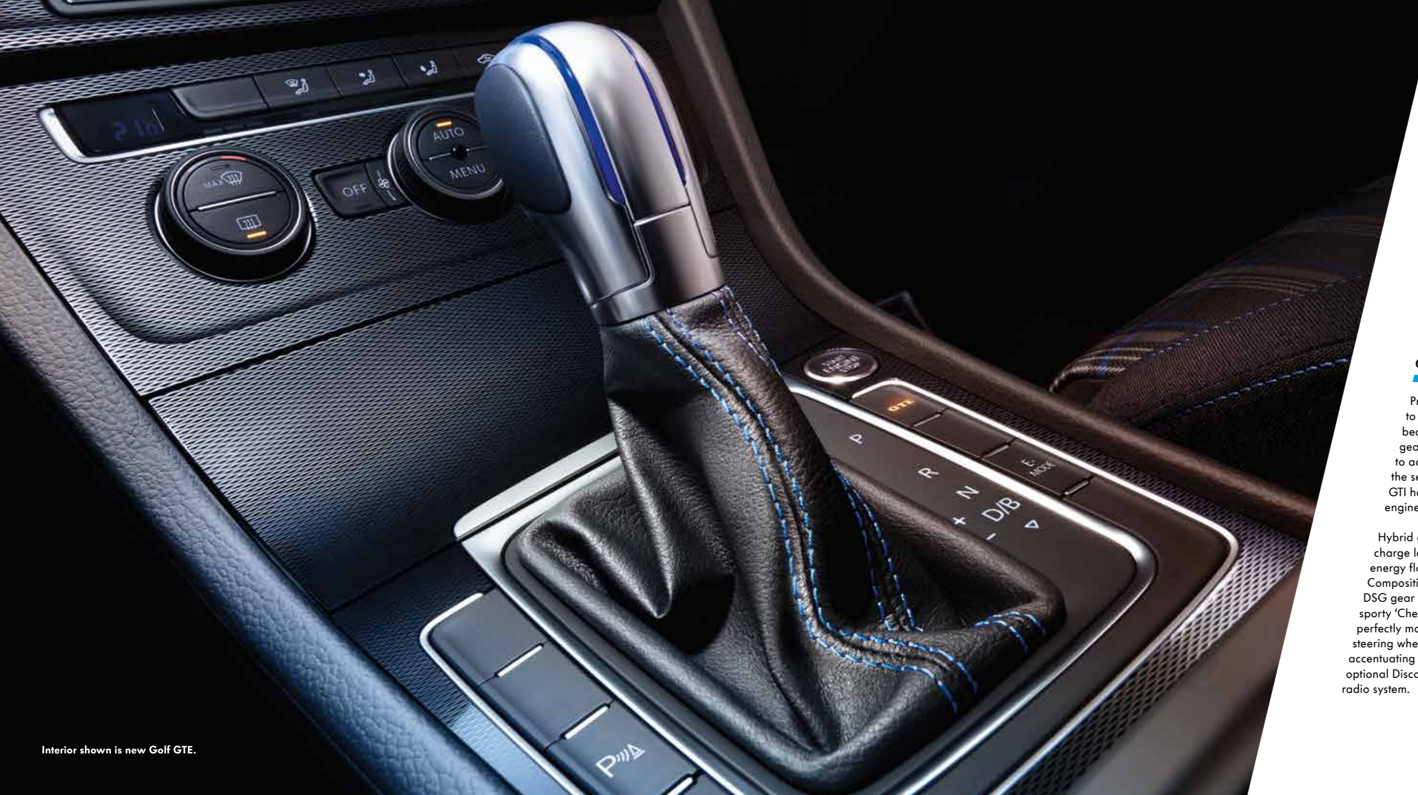
Interior shown is new Golf GTE.