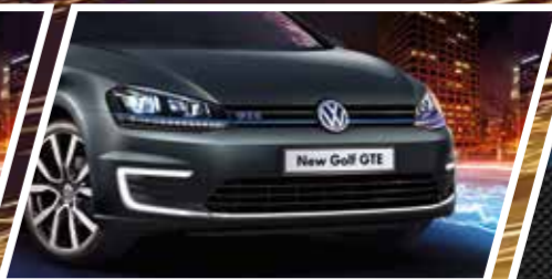
Carbon Grey 1K Metallic*