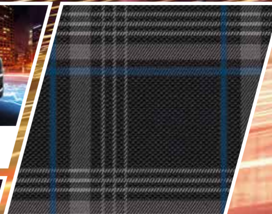
Standard 'Jacara Blue' cloth Titan Black/Blue TW