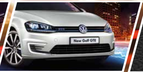
Oryx White OR Premium Paint*