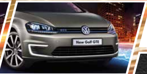
Limestone Grey Z1 Metallic*