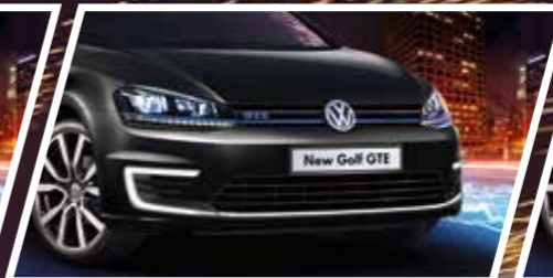
Black A1 Non-Metallic