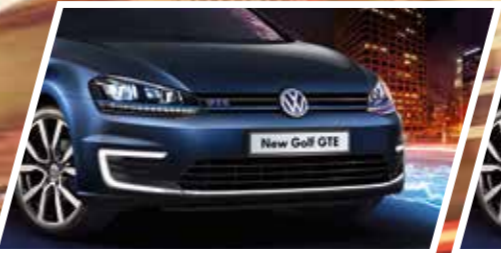
Night Blue Z2 Metallic*