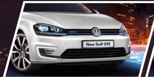
Pure White 0Q Non-Metallic*