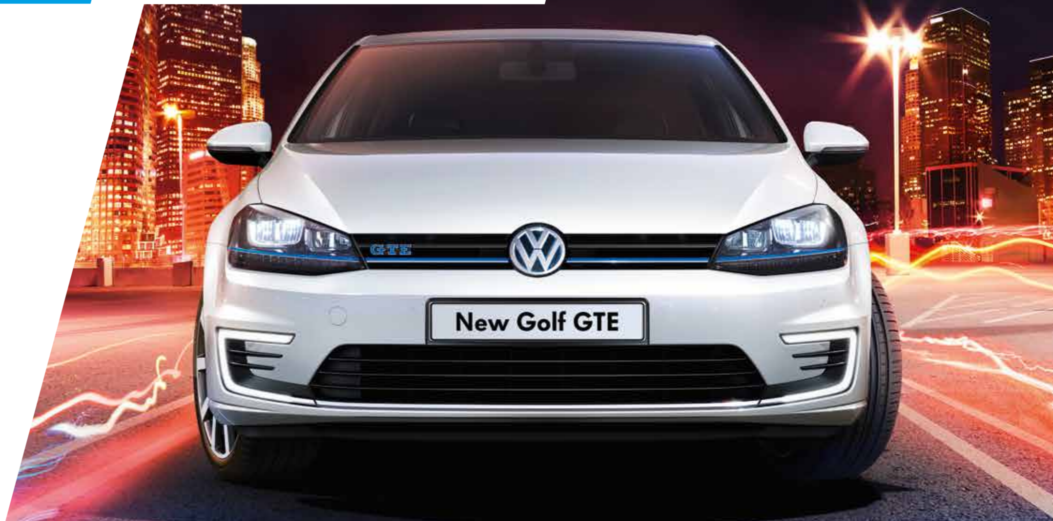
Model shown is new Golf GTE with optional premium paint.