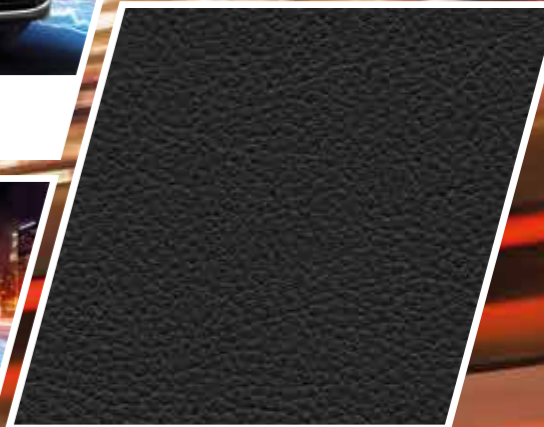
Optional 'Vienna' leather** Black TW