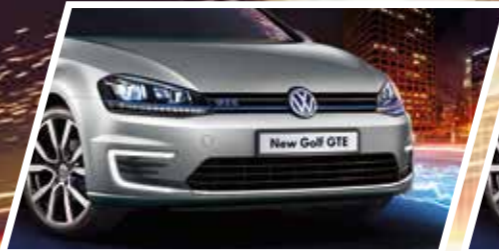
Reflex Silver 8E Metallic*