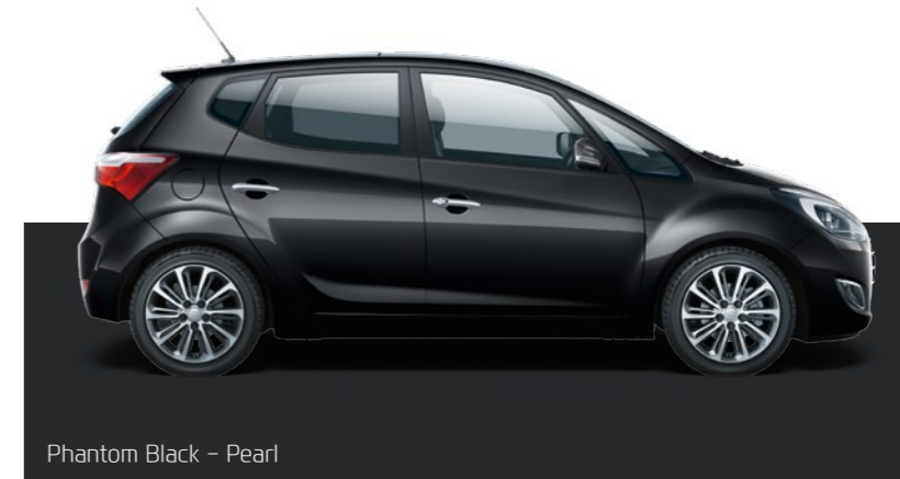
Phantom Black - Pearl