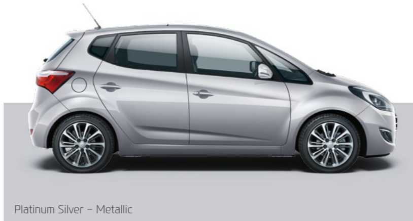
Platinum Silver - Metallic