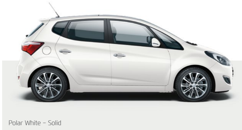
Polar White - Solid