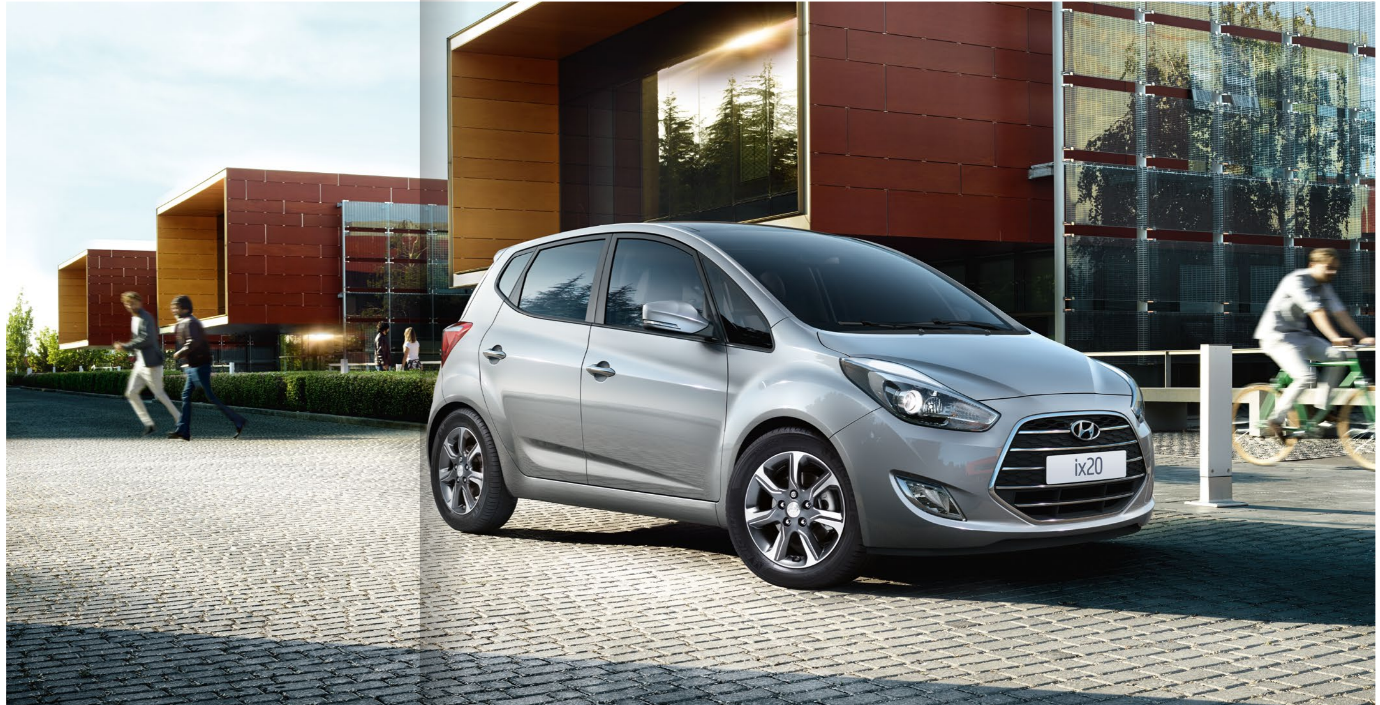
Car shown ix20 Premium in Platinum Silver metallic paint.

The ix20 doesn't do boxy. Its dynamic design, spacious interior and efficient drive are enhanced by all the clever little extras inside. It's the stand-out car in its class.