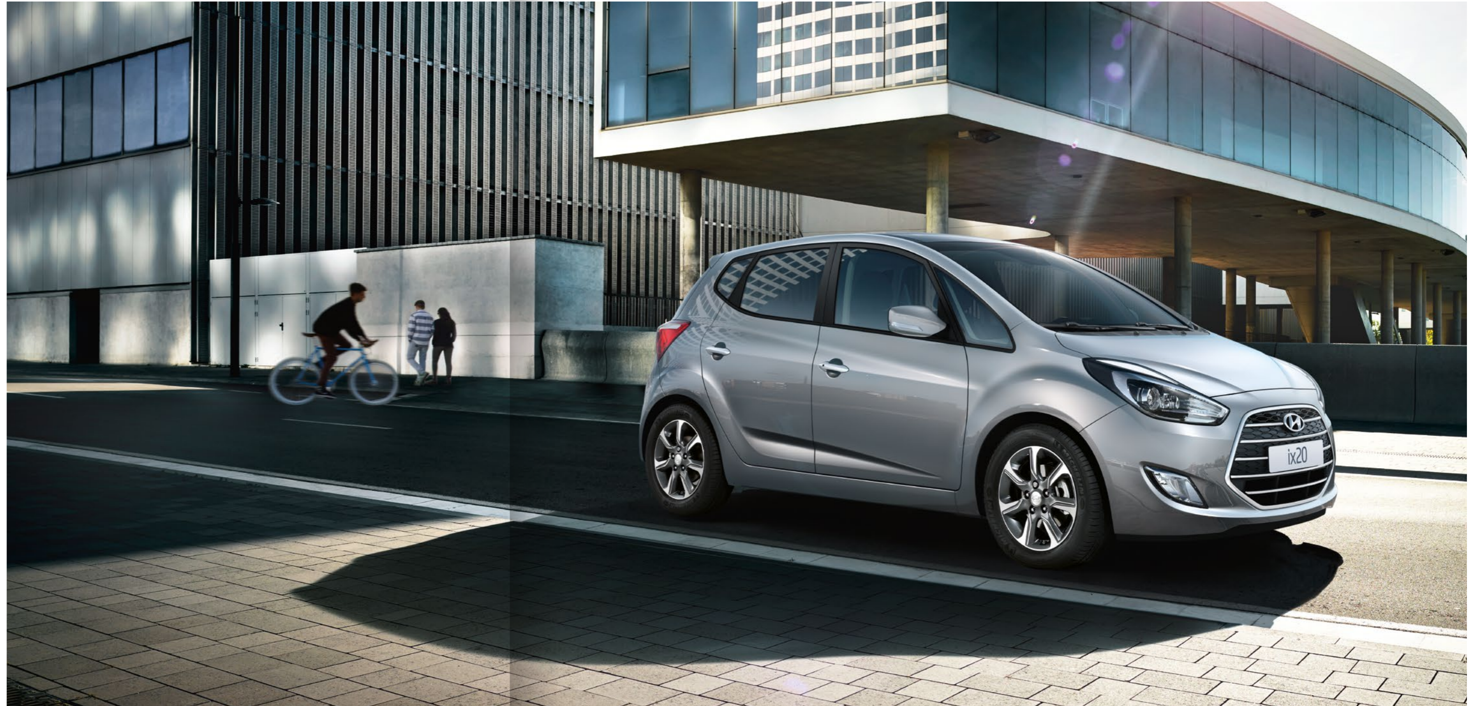
Car shown ix20 Premium in Platinum Silver metallic paint.

The ix20 manual models include Intelligent Stop and Go (ISG), which automatically stops the engine when you come to a halt, and restarts it again when you de-press the clutch. It also has low rolling resistance tyres and electric power assisted steering, which is quieter, lighter and saves energy – ultimately reducing emissions. As well as the 1.6 diesel Blue Drive, you can opt for a 1.6 petrol automatic or a 1.4 petrol manual. If you select manual transmission you'll also benefit from an eco-drive indicator which suggests the optimum time to change gear for maximum efficiency. It's our way of giving you more influence over your fuel consumption. With a range of high-tech engines optimised for greater economy, the ix20 is a perfect example of our fuel-saving philosophy.