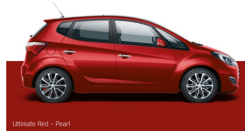
Ultimate Red - Pearl