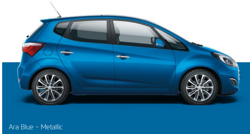
Ara Blue - Metallic