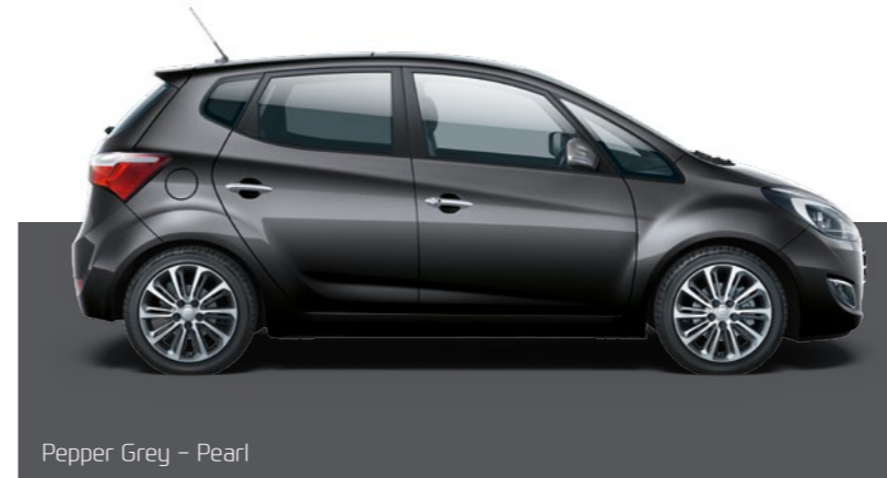
Pepper Grey - Pearl