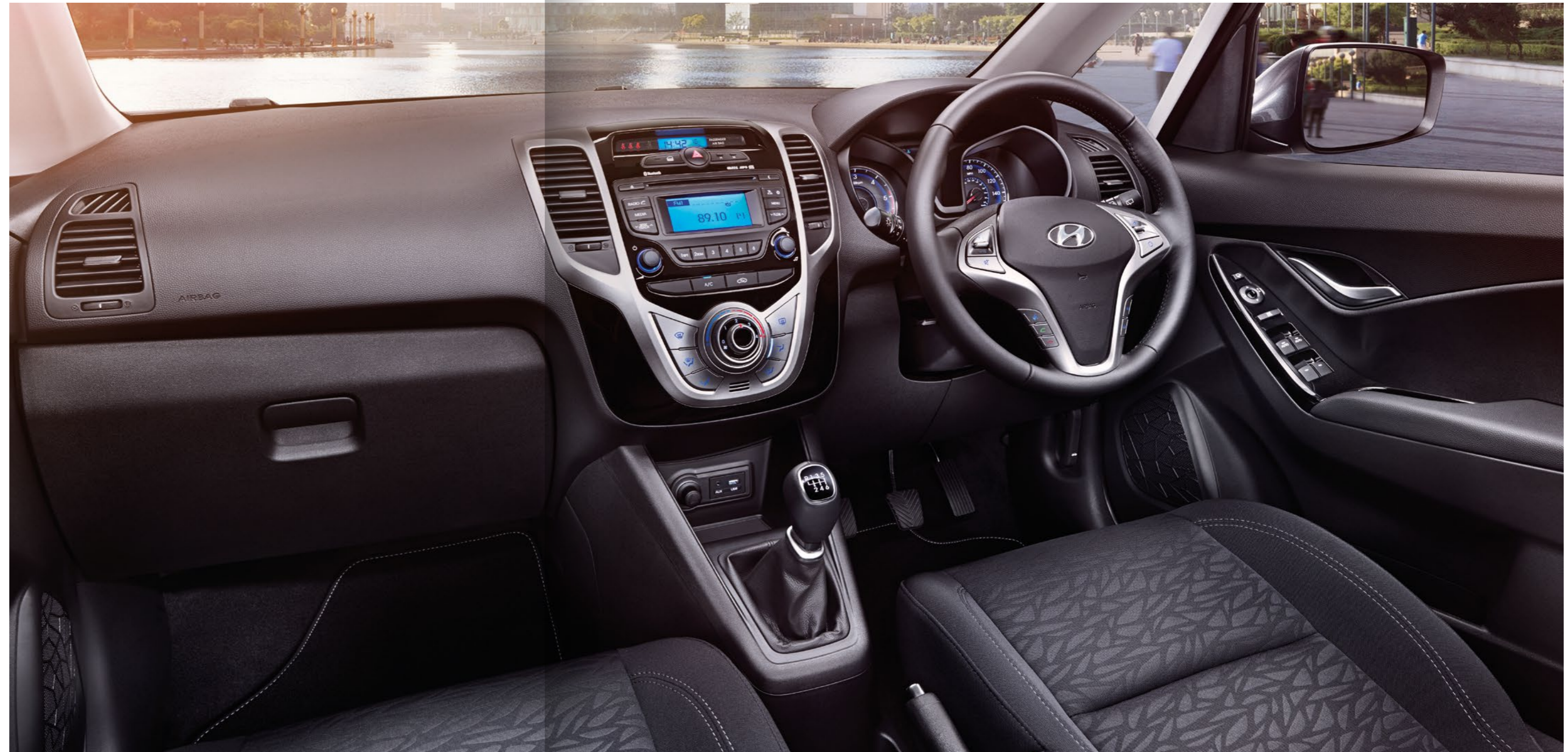
Car shown ix20 Premium.

You'll quickly notice the cool blue illumination of the instrument panel, while the soft touch feel of the dashboard adds to the smart ergonomics and quality design. Once you're sitting comfortably you'll be able to find the perfect temperature thanks to air conditioning. USB and aux connections allow you to plug in your compatible phone or MP3 player and listen to all your favourite songs. Enjoy a range of impressive features as standard, including Bluetooth® connectivity with voice recognition. Steering wheel audio controls also mean you can keep your ears trained on the music, and your eyes focused on the road ahead. And when you finish your journey, rear parking sensors help you to fit into the tightest of gaps.